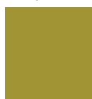
603 Martini Olive