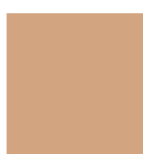
300 Terra Cotta