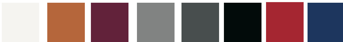
103 White Gloss