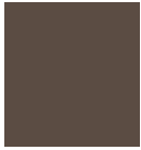
702 * Sienna