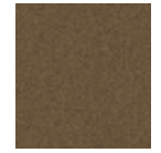
980 ** Topaz