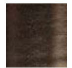
627 ** Golden Bronze