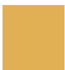
601 Pumpkin Spice