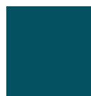
549 Asian Blue