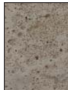
Wet Sand (tan)