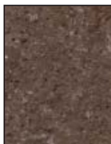
Walnut (dusty brown)