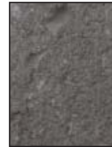
Granite (dark gray)

Color variations are inherent characteristics of all planters. Colors are represented as accurately as possible. Photographic procedures may alter the colors and images shown may vary slightly from the photo. For best results please call for a sample.