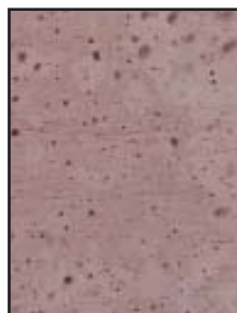
Sunrise (pale pink)