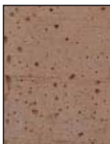
Clay (terra cotta)